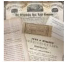
Exhibit opens June 23, 2018 and will be on display through June 2, 2019. This exhibit will examine the various transportation methods available in the North and South and how their use helped determine the course of the Civil War.